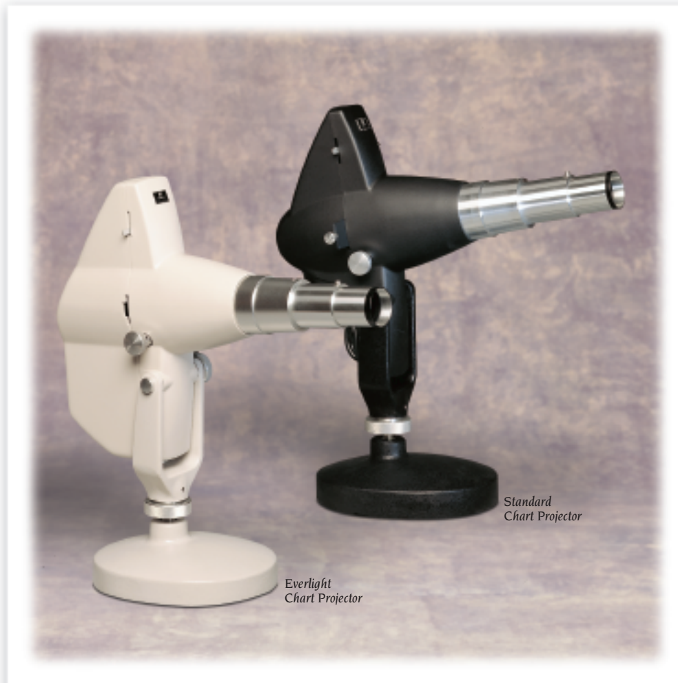
Everlight Chart Projector